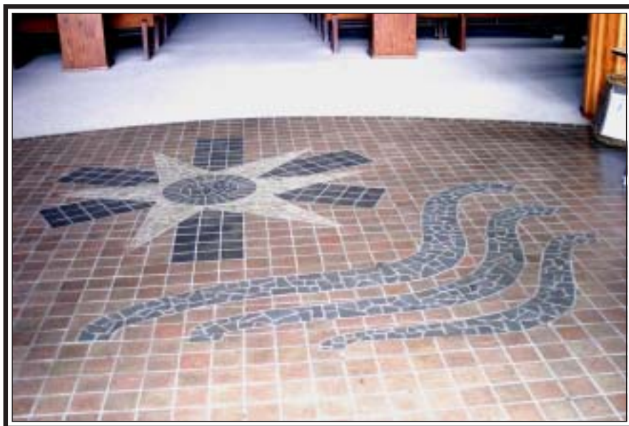
Waves forming three S’s, the initials for the Blessed Sacrament Fathers, greet worshippers at the entrance of Star of the Sea Church.

A mosaic at the church entrance seems to confirm everything. The image, created years ago, is a symbol of Mary, Star of the Sea — a star hovering over three waves. The waves appear as three fluid S’s, the abbreviation for the Congregation of