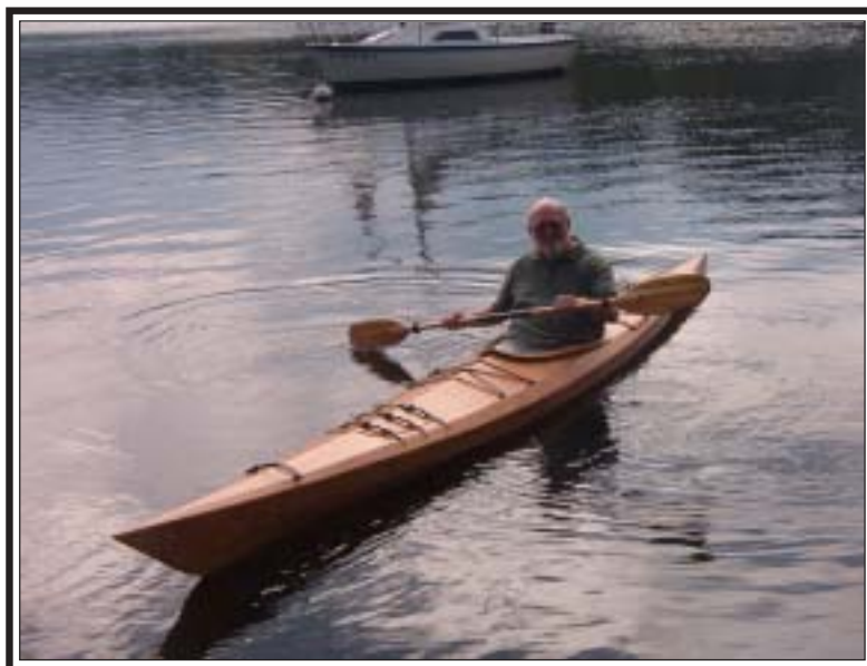
See, it really floats!