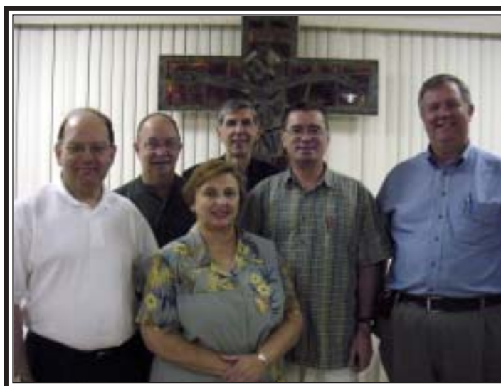
Group participants relaxing during a break from the day's activities.