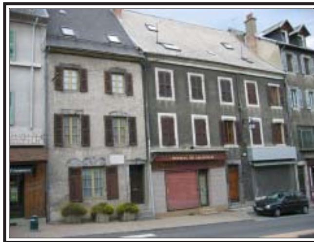
Peter Julian Eymard was born on February 4, 1811 in the house on the right which his father was renting. He died in the house to the left, which his father had eventually purchased for the family.

Our "happy birthday" to Fr. Eymard is the recognition that we continue the work that he began – the work of Eucharistic evangelizing. ✚