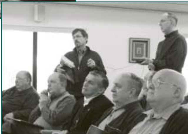
▲► SSS Chapter participants

At the Provincial Assembly late in 2005, plans were made for the Provincial Chapter, just as the plans and drawings for the new house were developed. Just as we here in Houston have watched the beginnings of the new house, so was I privileged to witness and even participate in the planning stage in California at the Assembly. At the end of that meeting, I was approached and asked to assist with the secretarial duties thereby becoming one of the “craftsmen” in its realization.