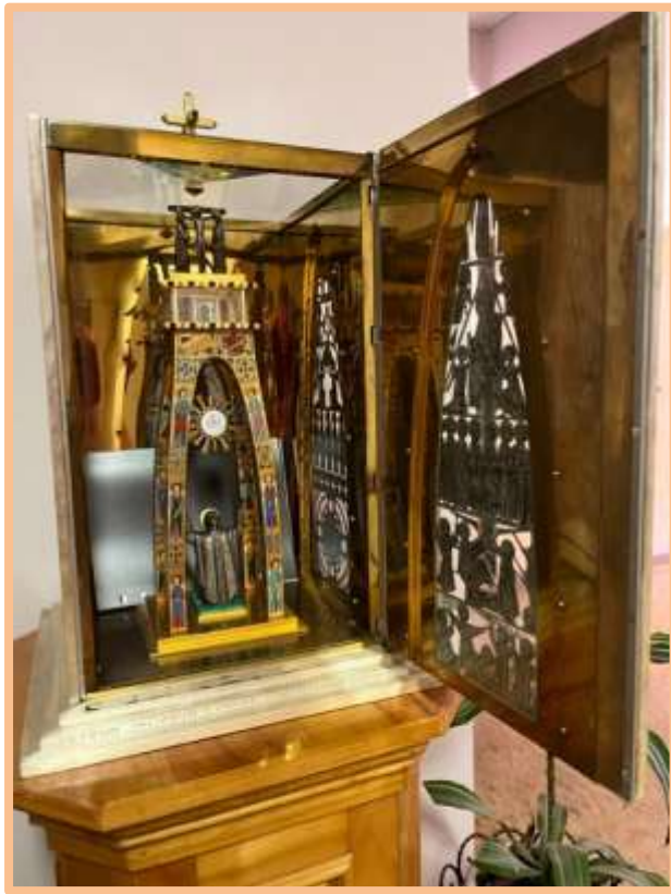
Reliquary of St Peter Julian Eymard in Sherbrooke