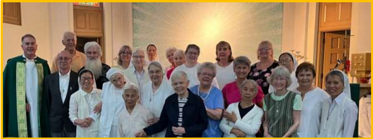
Servants of the Blessed Sacrament and Associates in Waterville, Maine