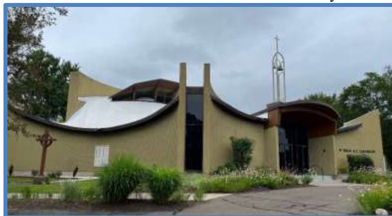
Saint Philip Church in Norwalk, Connecticut