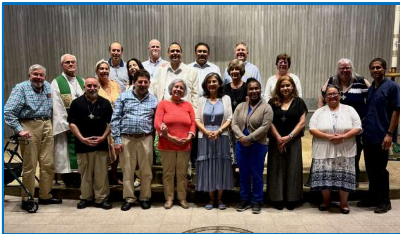
Associates at Saint Philip in Norwalk