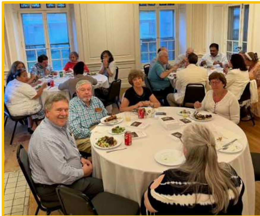
Sharing a meal at St. Philip in Norwalk, Connecticut