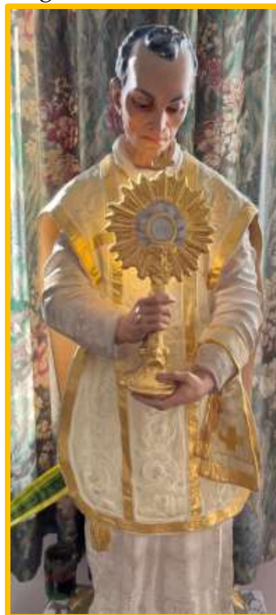
Statue of Saint Peter Julian in the Servants of the Blessed Sacrament Community in Sherbrooke, Canada

Between the prayer at our sisters’ chapel and Saints Philip and Jean Baptiste, the drive with my own