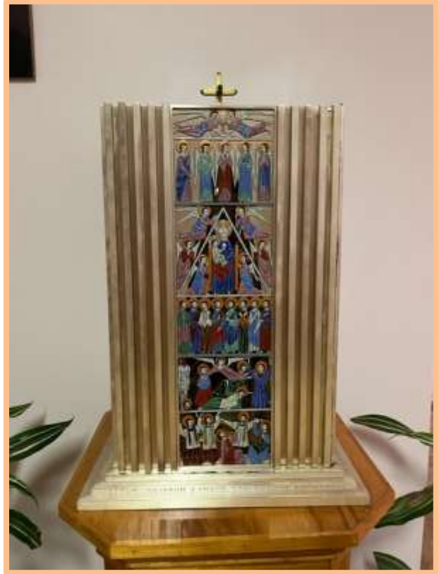
Reliquary of St Peter Julian Eymard in Sherbrooke

prayer time and reflection, it was my great retreat of summer 2023, and I am so grateful for the outstanding hospitality the sisters, our community at Saint Jean's and our Associates in Connecticut. The spirit of Eymard and Eucharistic evangelizing is alive, well, and thriving, thanks to all of these members of the Eymardian Family. I look forward to visiting again soon.