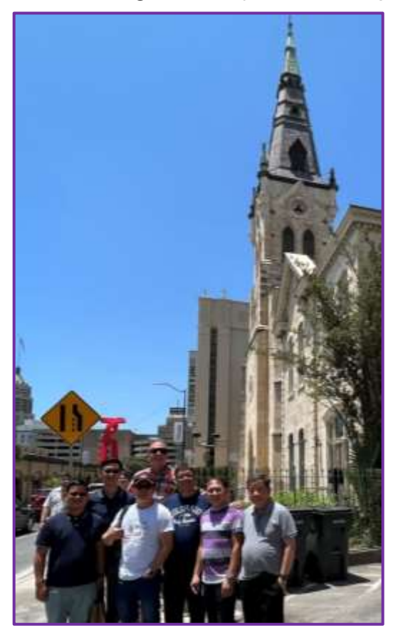
SSS Relgious gathered in front of Saint Joseph Church in downtown San Antonio

archdiocesan offices to promote this event in the life of the Church of San Antonio. Planning was for over a year; it was interesting to hear the different pieces that made the procession successful. Due to technical difficulties, we could not see a highlight video (though we may remember pictures from a recent Grapevine in June). Instead,