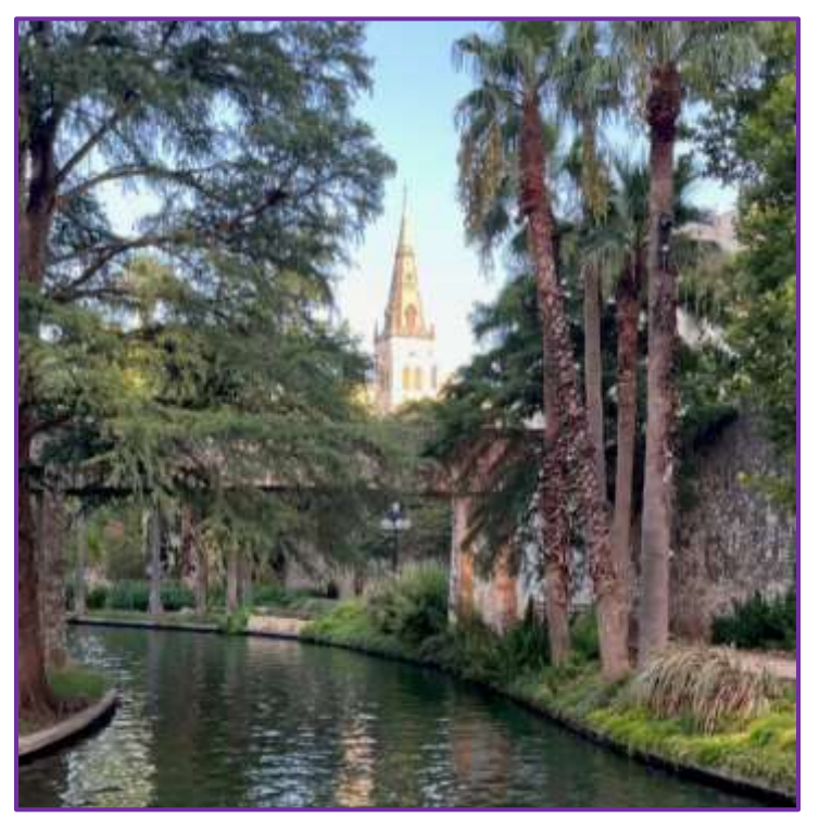
St Joseph Church taken from the San Antonio Riverwalk

Thank you, San Antonio Associates and parish members, for your awesome Texan hospitality; your warmth is greater than the heat wave of Texas! We are so blessed by your living the Eucharistic life and being true "apostles of the Eucharist."