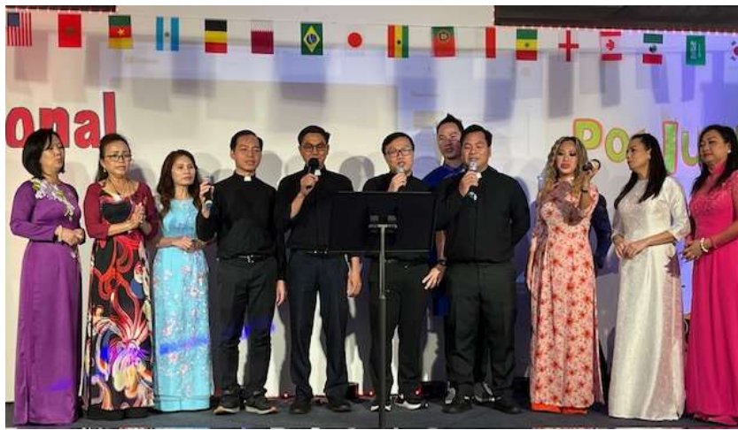
Vietnamese community and priests entertaining