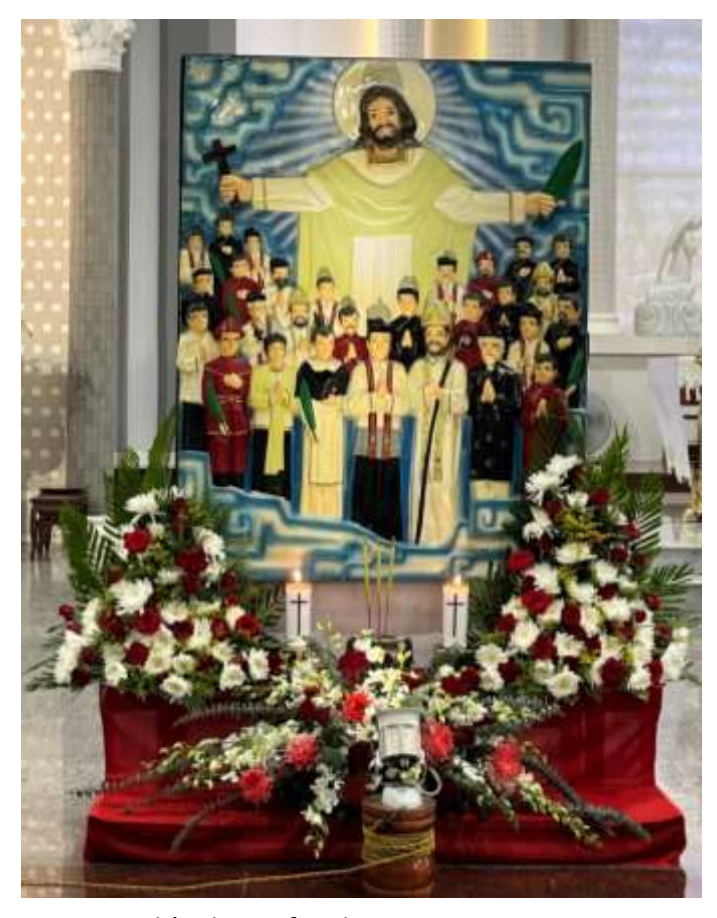
Parish's shrine for the Martyrs in Vietnam