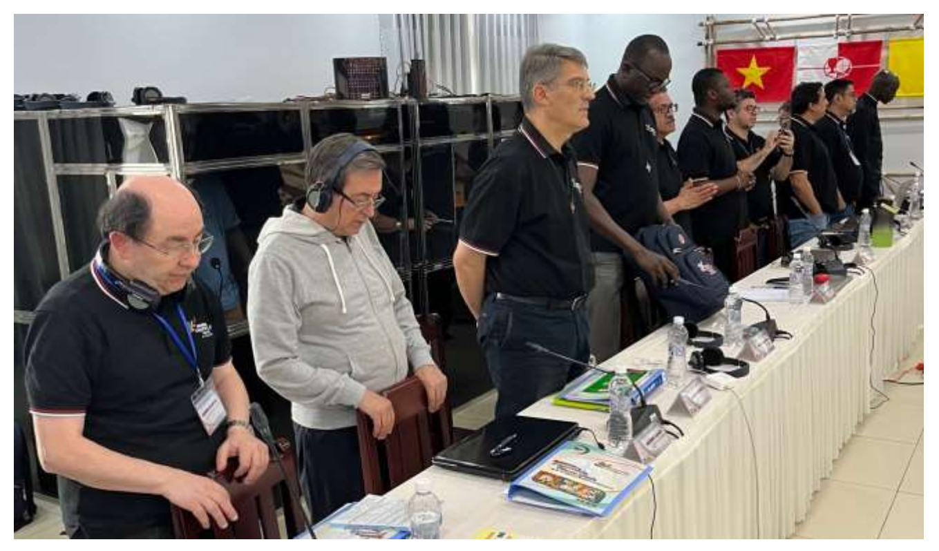
We sing our Chapter theme song one last time before concluding