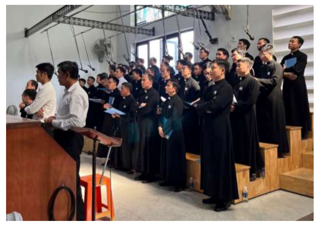
SSS student choir