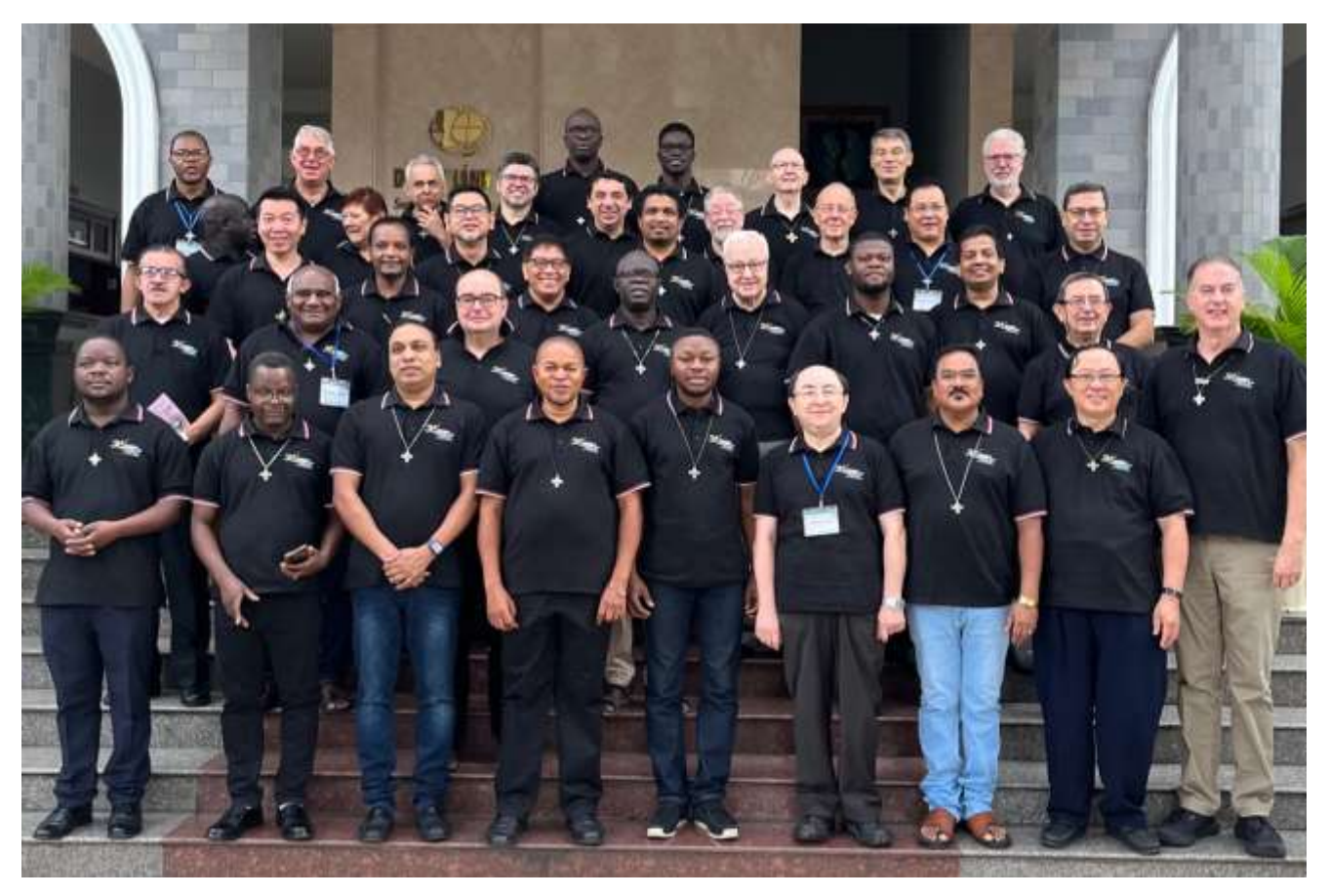
Capitulars in the official photo