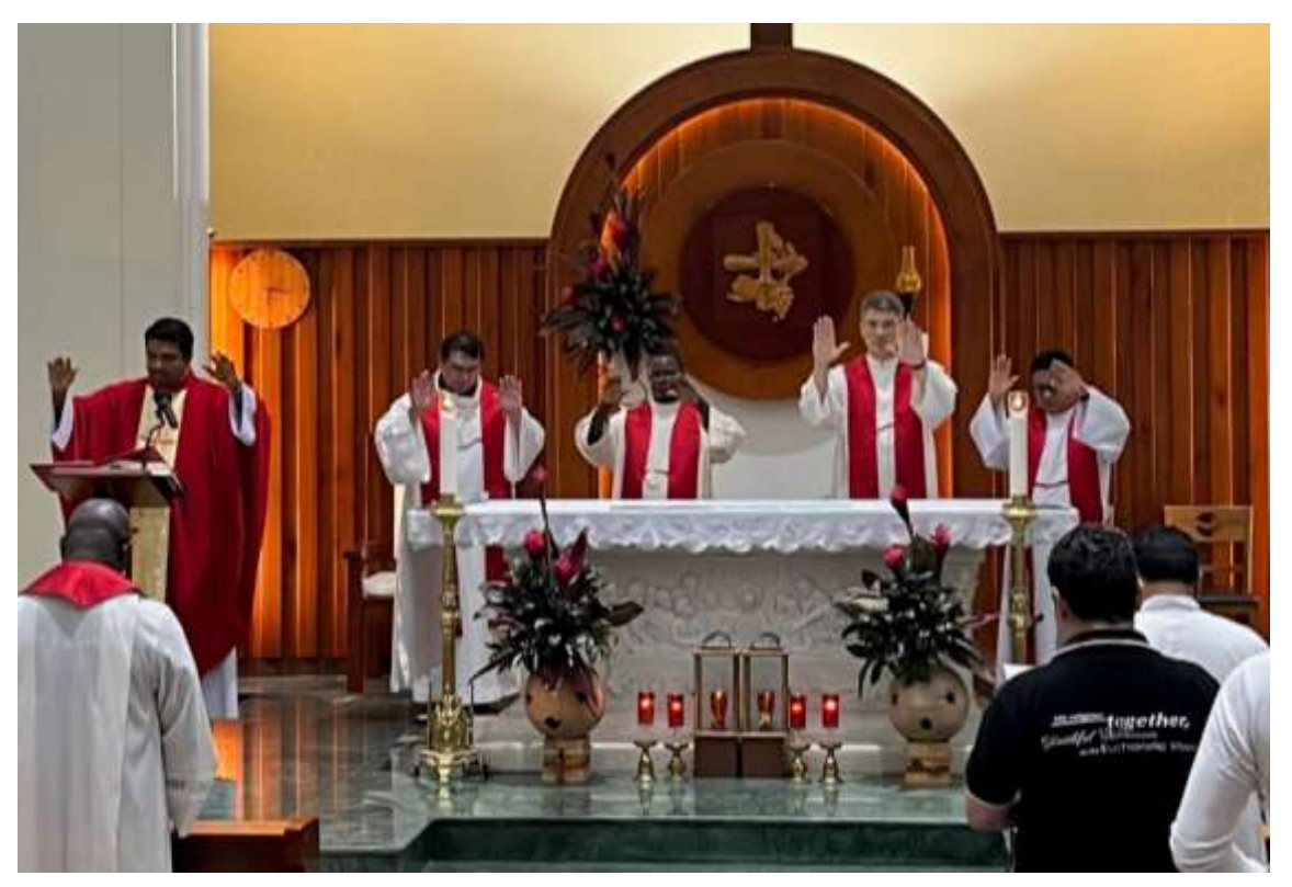
Superior General and General Consultors blessing Capitulars at the end of the Mass