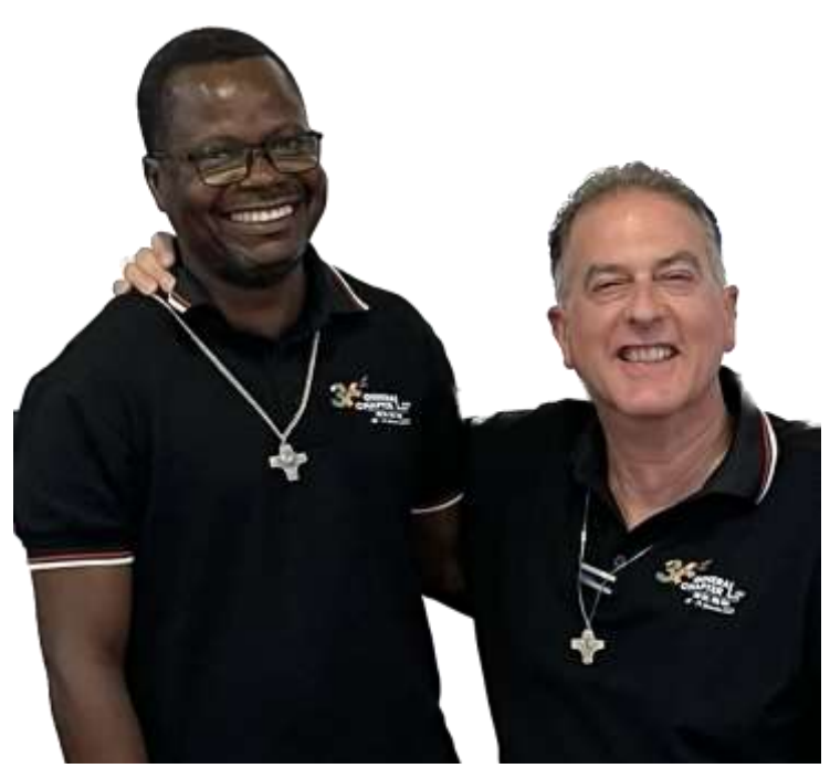
Our new Vicar General, Anaclet Bambala SSS (Democratic Republic of the Congo)