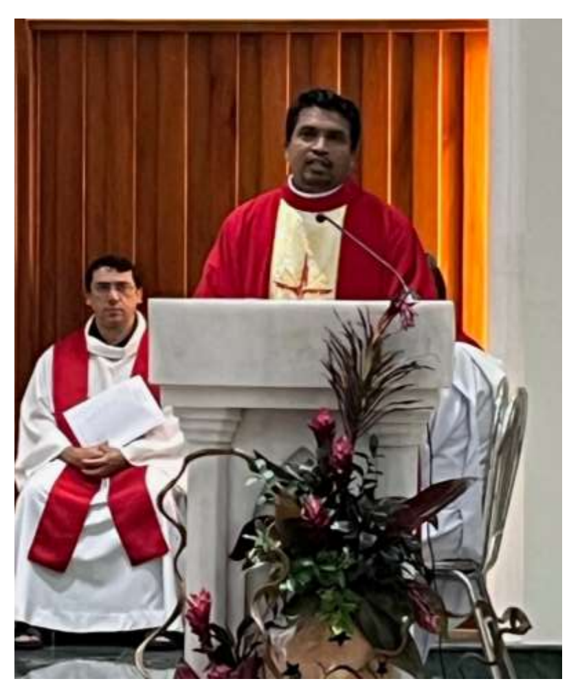
New Superior General delivering a message of service