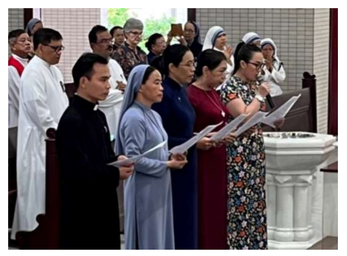
Members of the Eymard Family offer the Universal Prayers