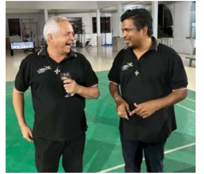
Former and current Superior Generals enjoying a moment