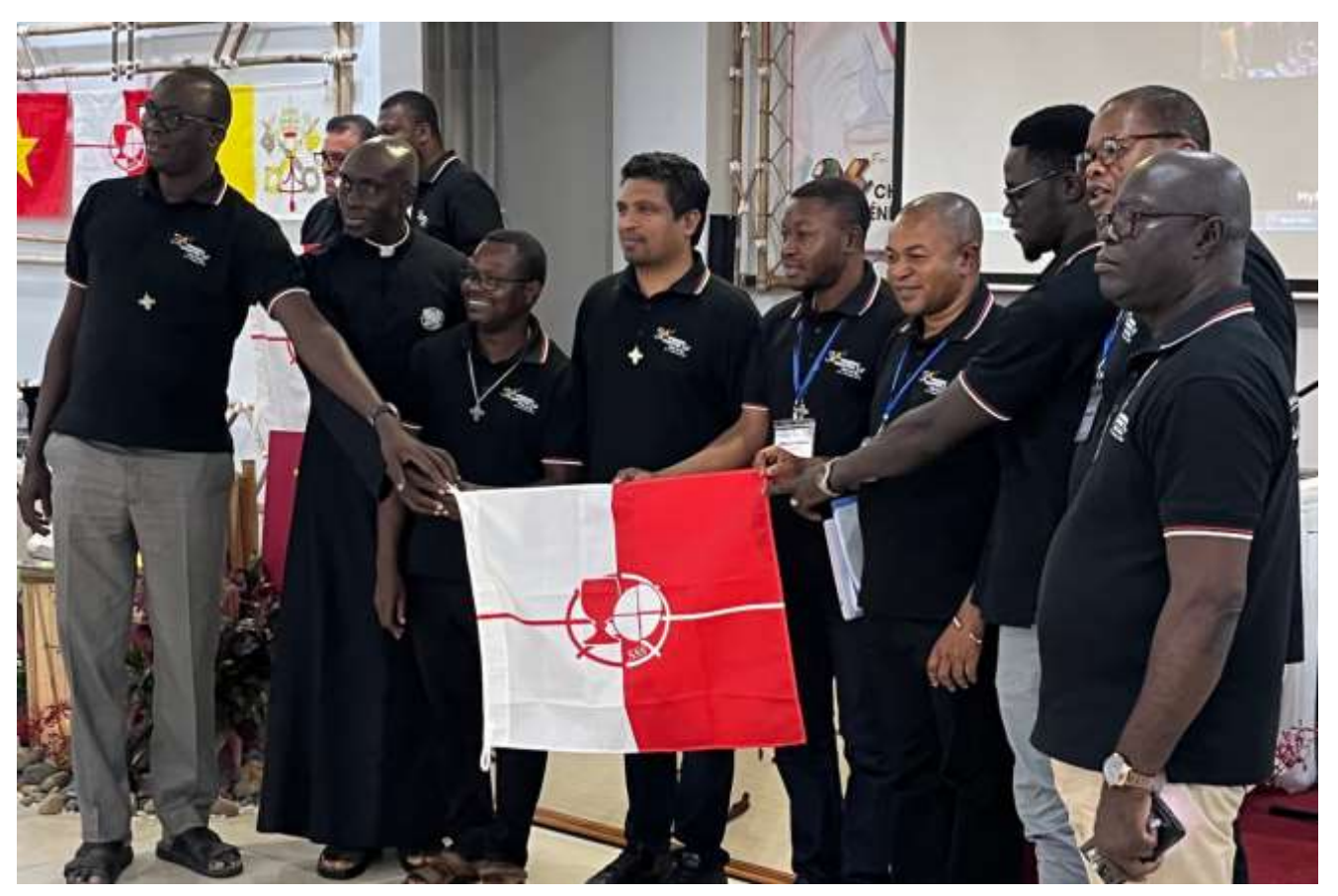
Africa Conference with our flag and Superior General