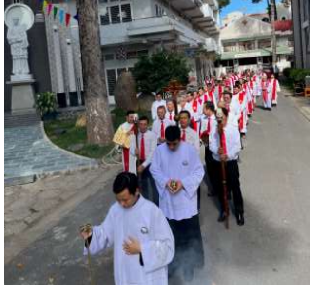
Procession to Mass for the Feast of the Martyrs of Vietnam