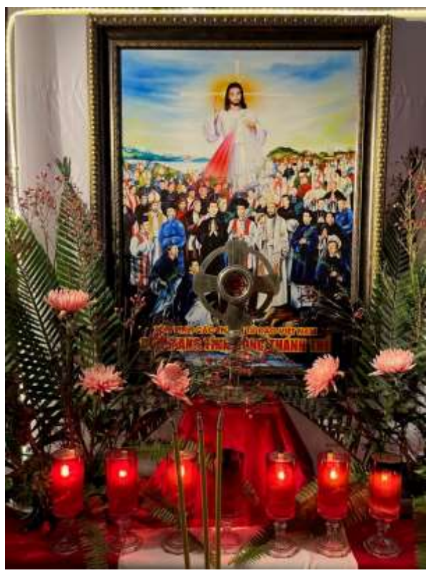
Martyrs in Vietnam shrine for the patronal solemnity of the Vietnamese Province