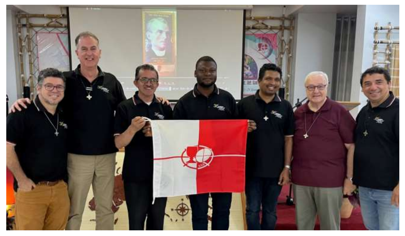
American Provincials with the new Superior General and new flag