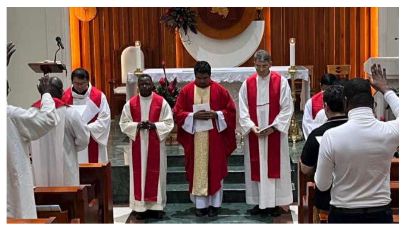
The Capitulars bless the new General Team