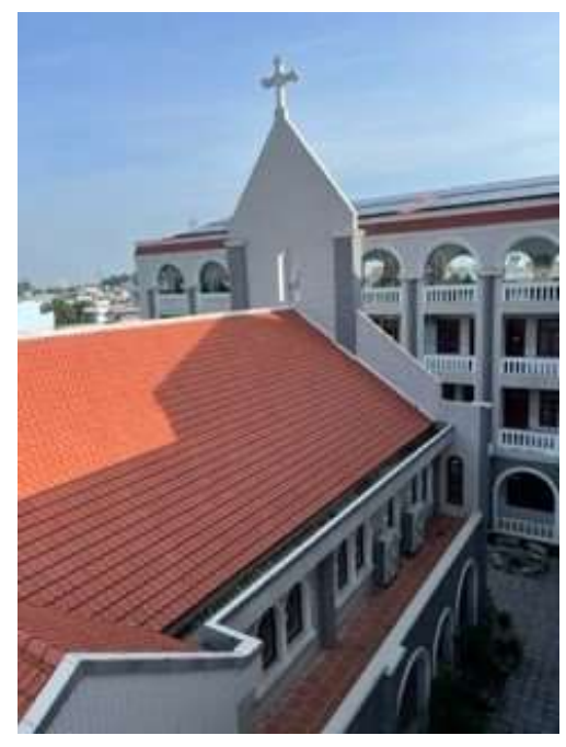
SSS HQ chapel is in the middle of the complex