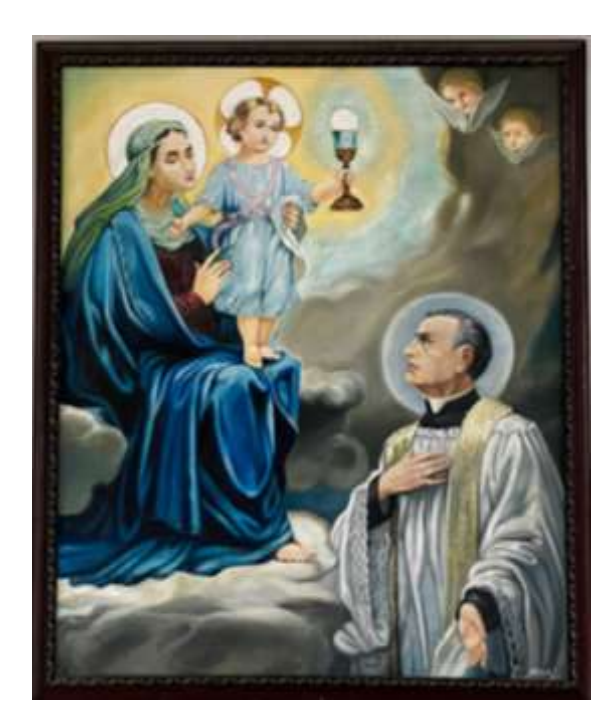
Artwork in SSS Complex