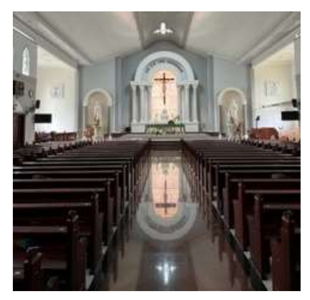
Interior of the parish church across the street