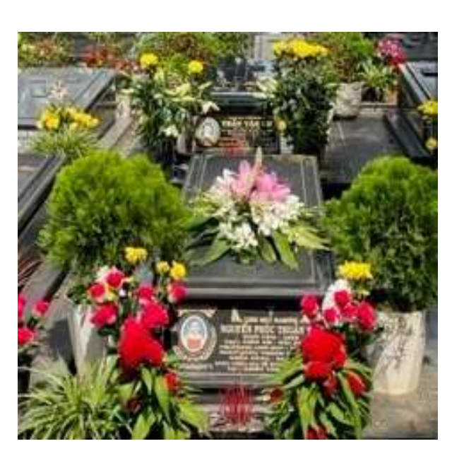
Burial Site for our SSS Vietnamese Religious – among whom Father Dominic Thuan SSS