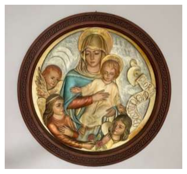
Artwork in SSS Complex