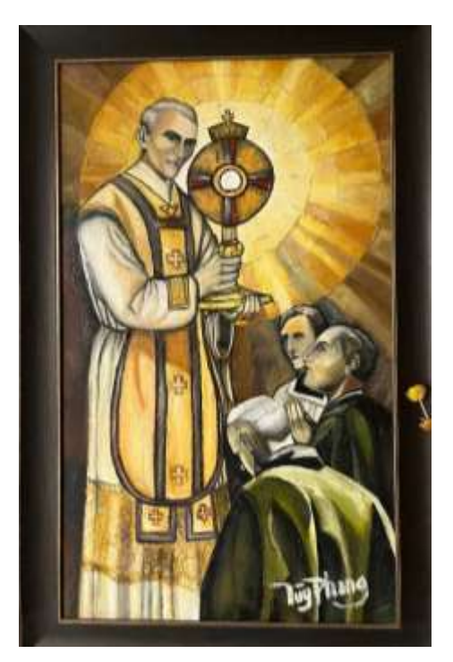
Artwork in SSS Complex