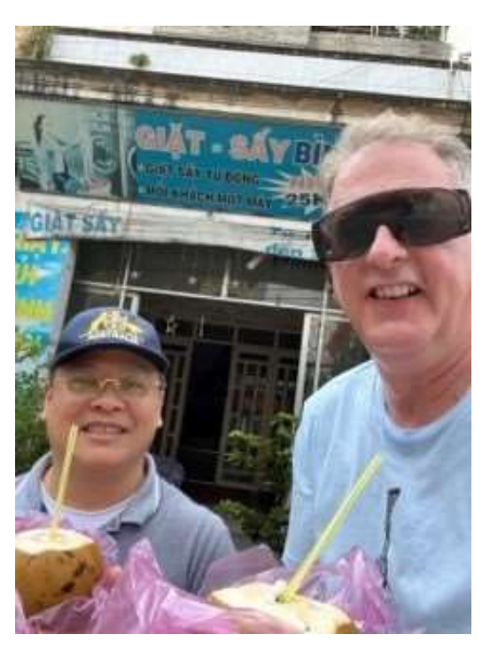
Refreshment on a hot day