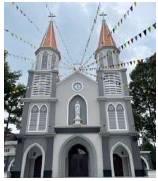
SSS Parish Church