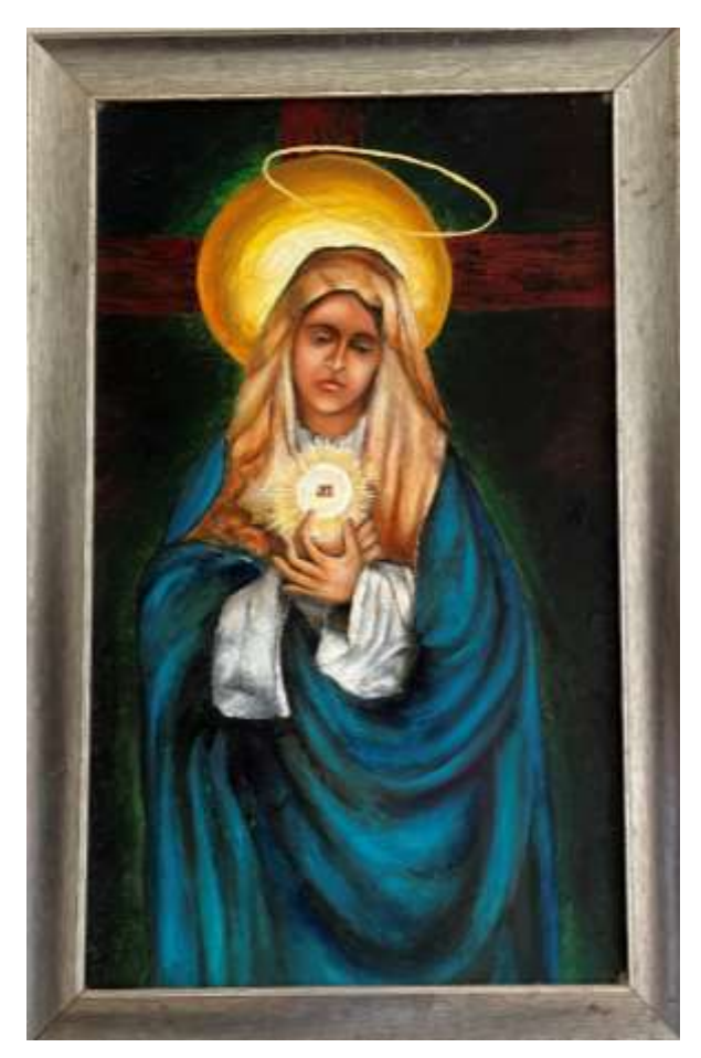
Artwork in SSS Complex