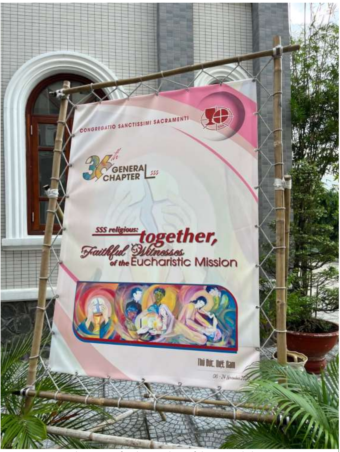
Welcome Sign for the Members of the General Chapter