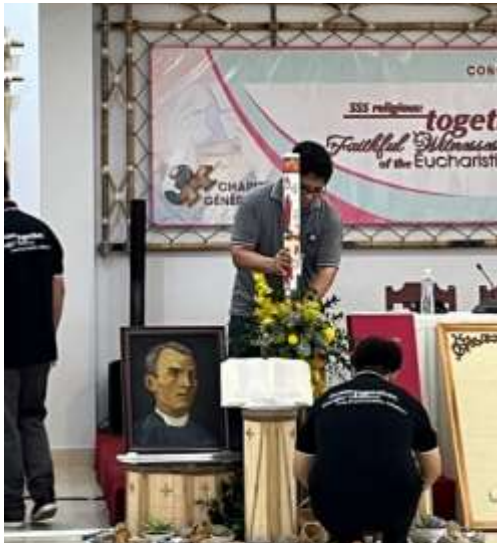
Placement of the Chapter Candle, Bible and Rule of Life