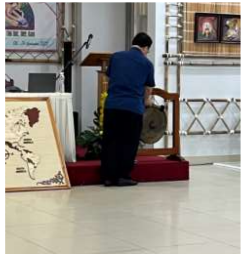
Ringling the Gong