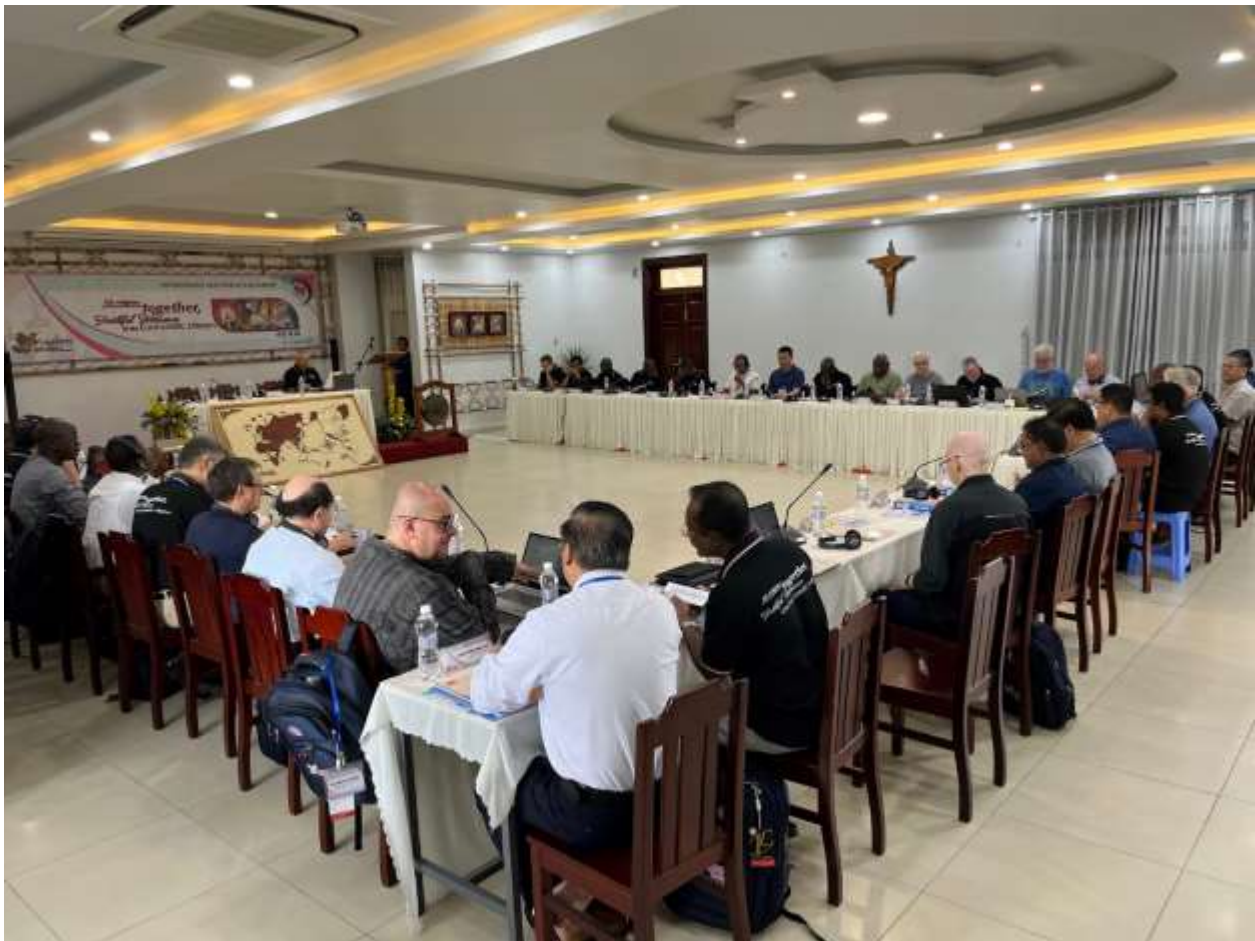
In the Meeting Assembly Hall