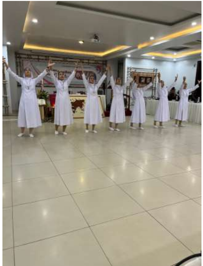
Our Vietnamese Sisters add our to prayer ritual