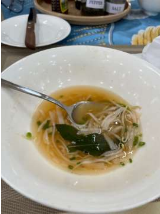
Pho (delicious Vietnamese breakfast soup for us) is what many of us take.