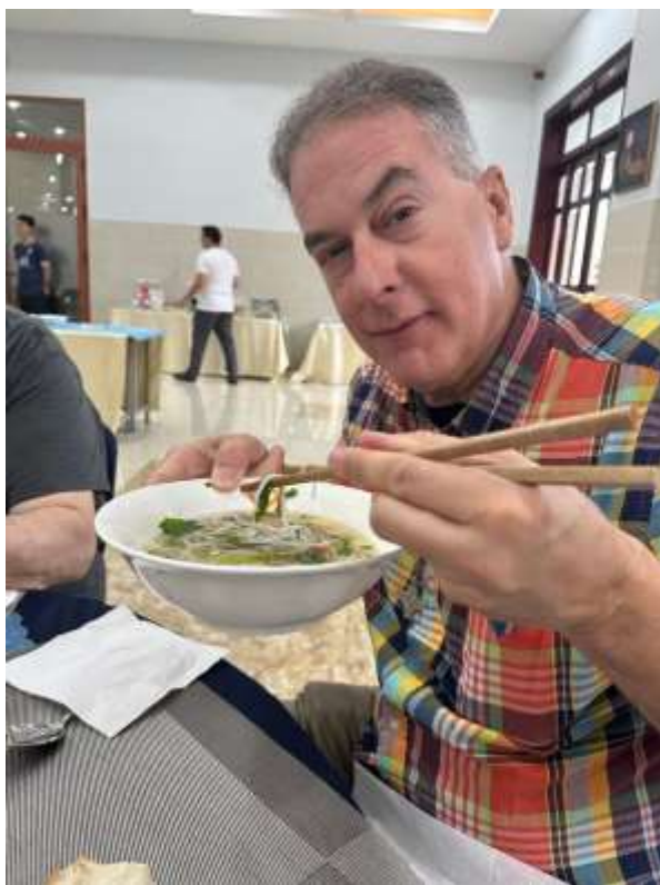
Breakfast pho, while mastering chopsticks