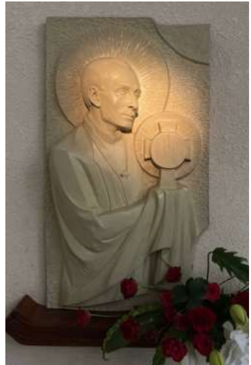
Saint Eymard in the Scholasticate Chapel