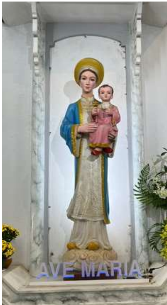
Our Lady of the Blessed Sacrament statue in the parish church of the SSS, sight of the former scholasticate, home to a future retirement center for the SSS.