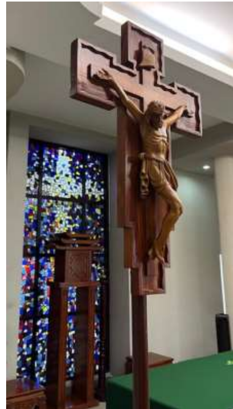
Chapel crucifix and tabernacle