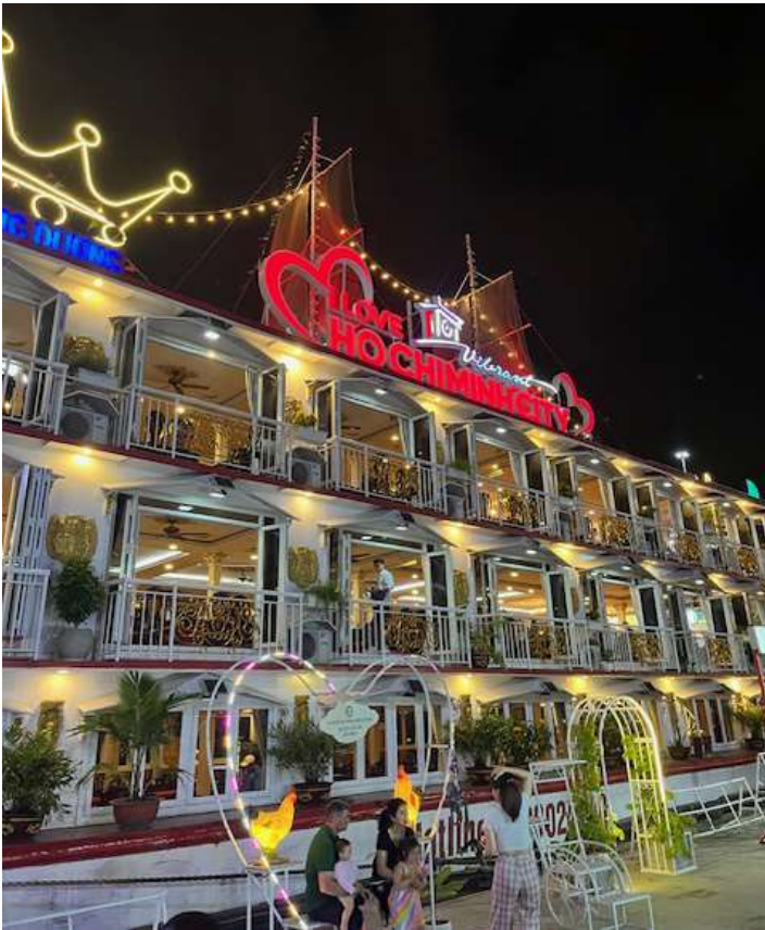
Our ship for a cruise/dinner on the Saigon River