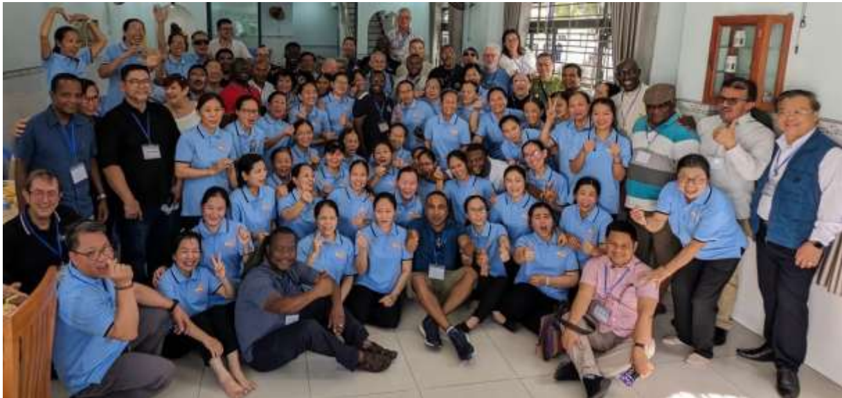
Servitium Christi Gathering