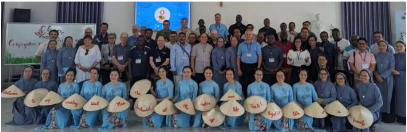
Servants of the Blessed Sacrament

Netherlands. There is a big gap between the generations of the Asian young and “First World older members” as sister stated. “But the young and old work together!”