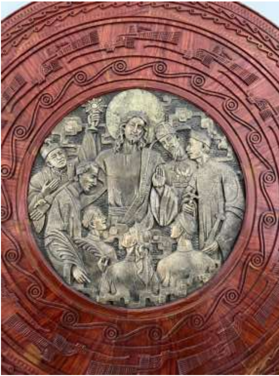
Ikon of the Martyrs in Vietnam