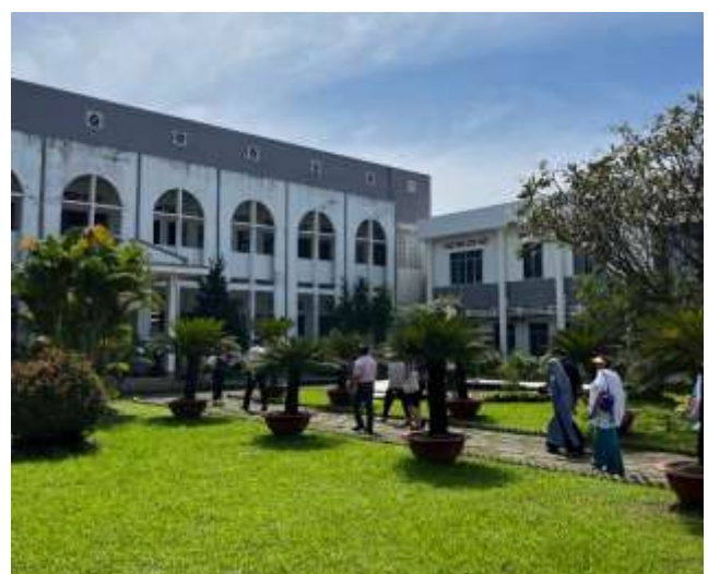
Servants of the Blessed Sacrament headquarters near Saigon