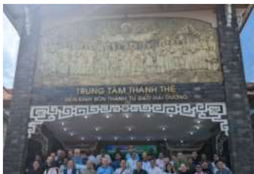
First stop nearby the SSS parish and future site of SSS men's health and retirement center