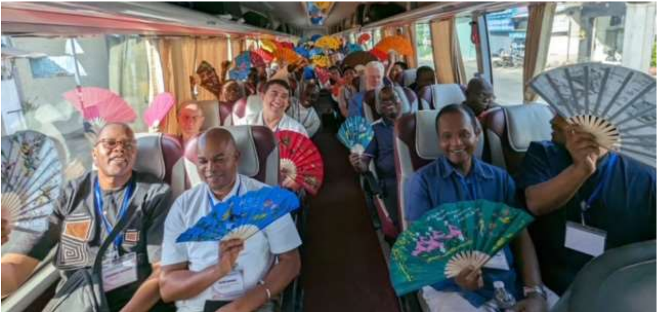
A long day and bus ride beginning at 8 am and until 10 pm