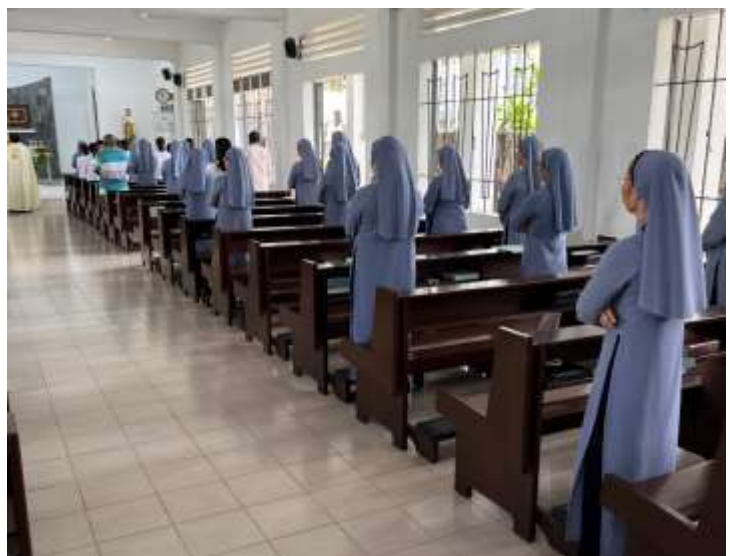
In the Servants' Chapel for prayer