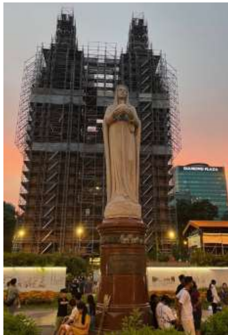
Notre Dame de Saigon Cathedral