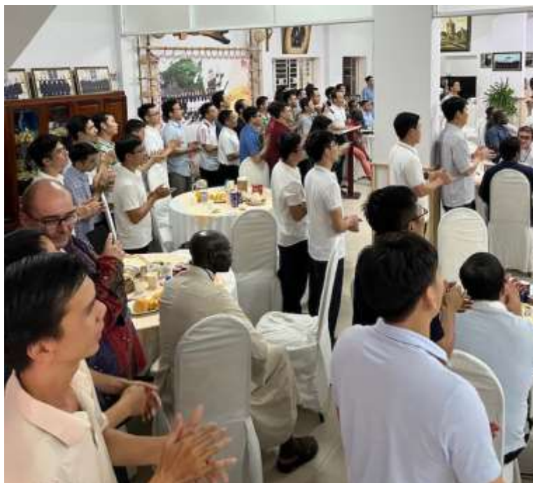
Our 54 students greet us with singing!