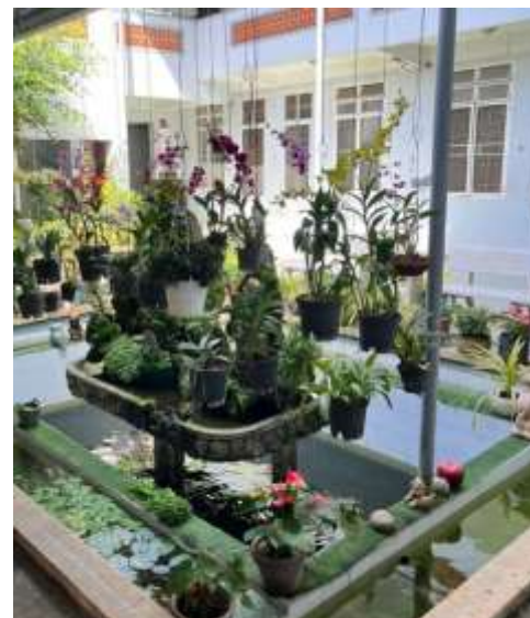
Inside courtyard and original novitiate