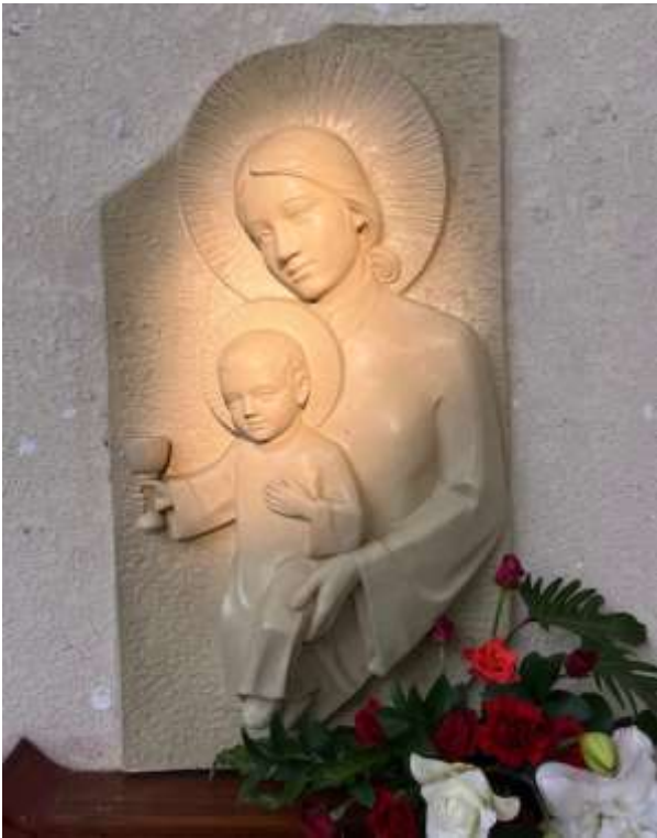
Our Lady of the Blessed Sacrament in the Scholasticate Chapel