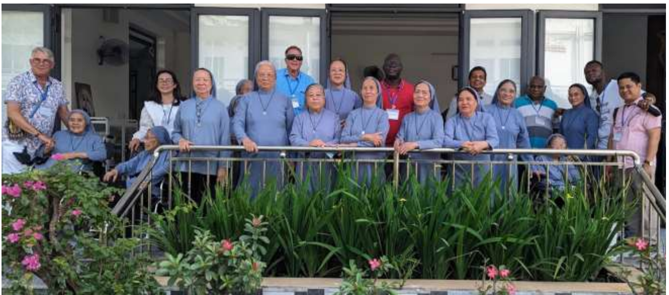
Retired Servants of the Blessed Sacrament in their new house at their Provincial Headquarters

The initiative to create a “Charismatic Families group,” with the aim of sharing experiences and reflecting on the importance of this organization, came to realization in 2014. Two meetings are organized during the year, with an elected coordinator leading the activities. A YouTube channel has been created, through which we can follow some of the uploaded content: Famiglie Carismatiche .