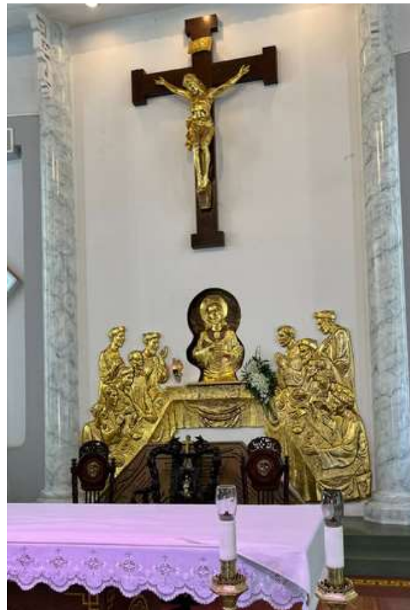
Sanctuary in the parish church