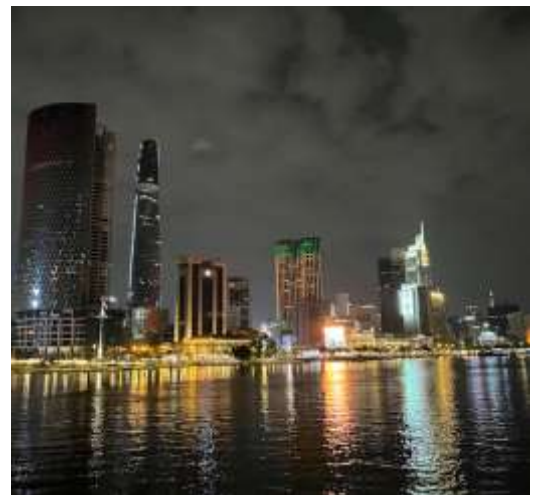
Saigon by night