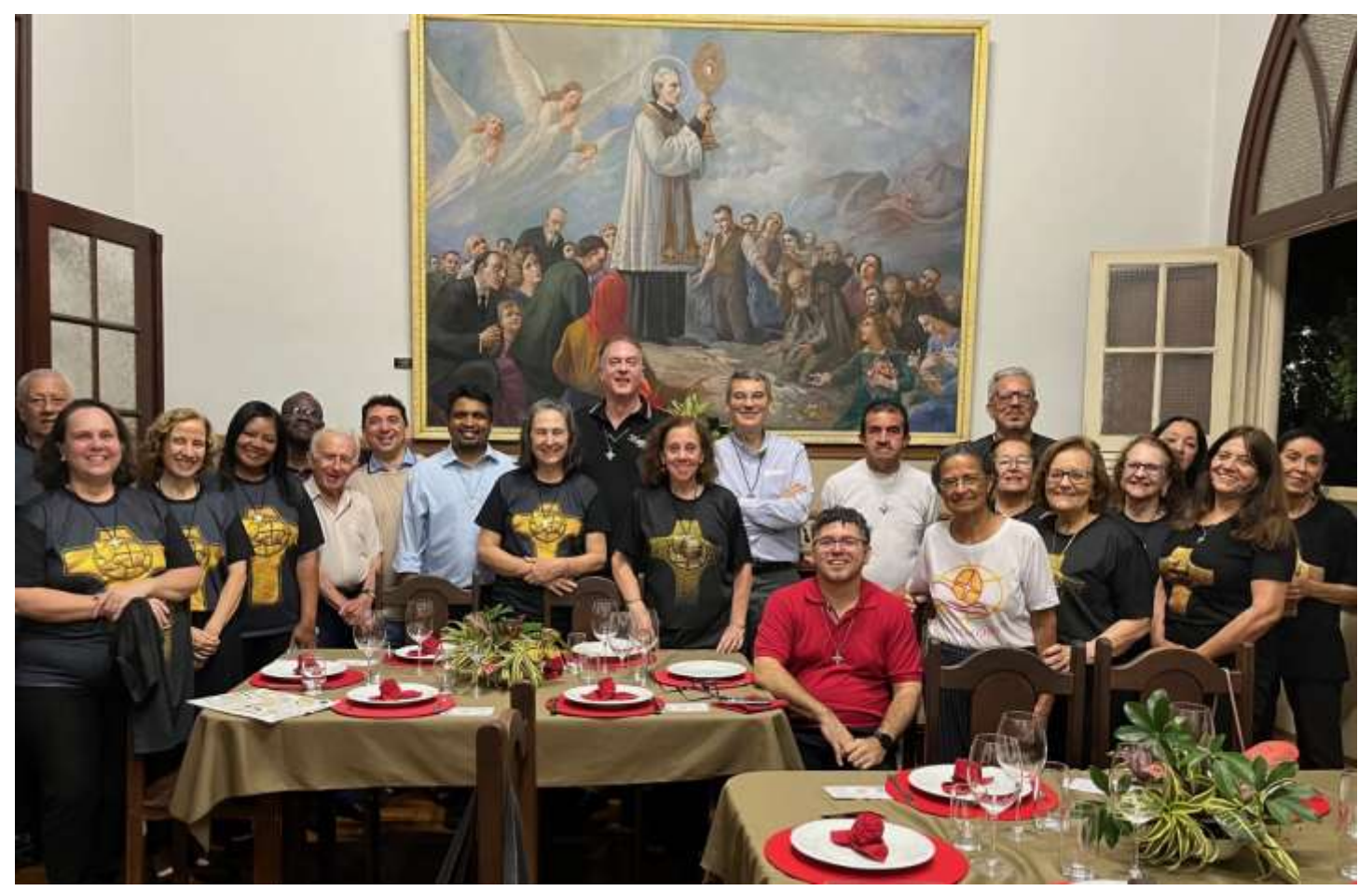
Gathering in Belo Horizonte with SSS Religious and Associates

We discussed these points and what each province is doing to work on these goals. (Besides the retreat, our province is offering the Eymard Pilgrimage in November and a chance for our Spanish-speaking members – associates and vowed members – to attend the International Eucharistic Congress in Quito. More on this in a moment.)