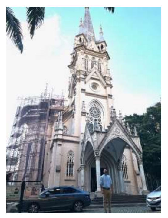
Church of Boa Viagem

The statutes of these conferences are to be approved by the superior general and his council. They shall indicate the conference's competence, composition, and manner of operating.