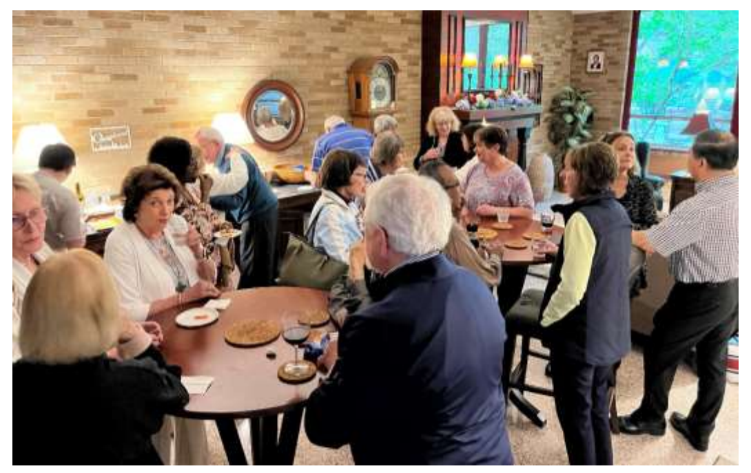
SSS Eymardian Family in Highland Heights, Ohio

Following Evening Prayer, the Associates led a potluck dinner in the Blessed Sacrament Community Fireside Lounge and Dining Room to cap off a great day living the Eucharist.