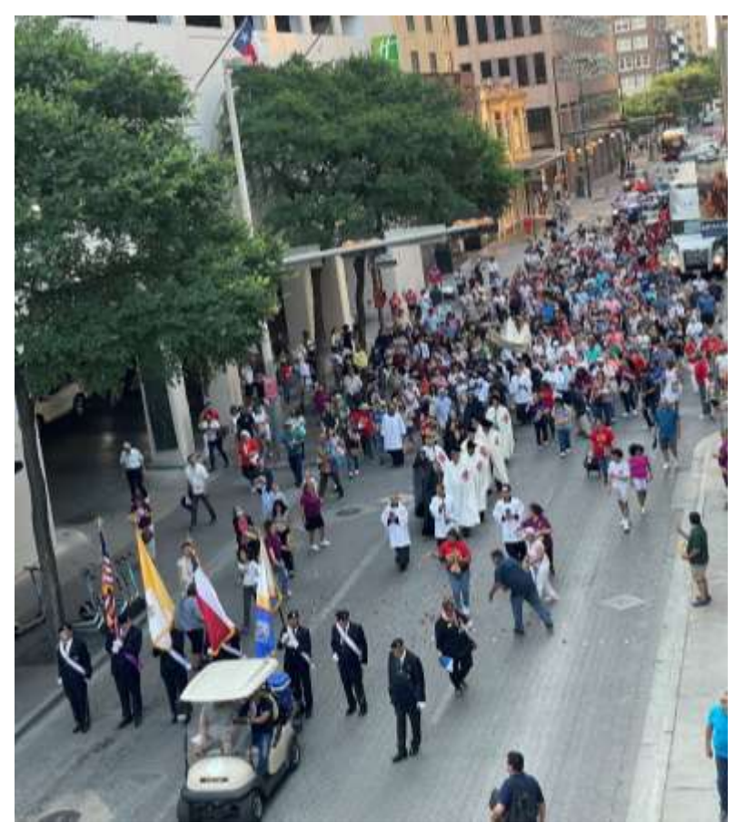
Blessed Sacrament Procession through downtown San Antonio

identified by the red t-shirts bearing a gold monstrance on the front and "Follow Me" on the back.