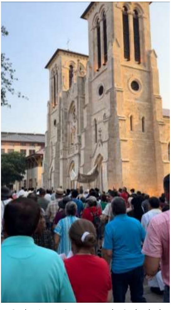
Gathering at San Fernando Cathedral

Archbishop held Christ up victoriously in the monstrance surrounded by Acolytes, Deacons, Priests, Seminarians, and many religious and ministries in attendance, along with the associates and others from across the Archdiocese. The faithful lined the streets in anticipation of the arrival of our risen and glorious Jesus Christ in The Most Holy Eucharist. In collaboration with the Archdiocese of San Antonio, our faithful Associates