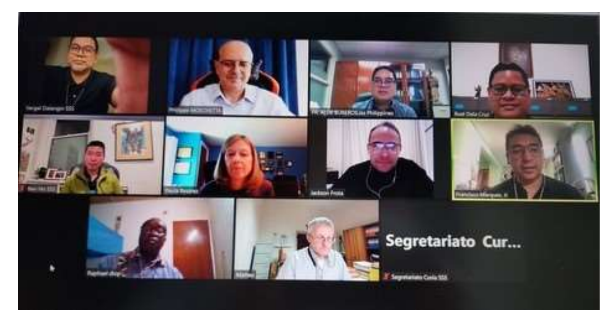
ZOOM: International Finance Commission Meeting