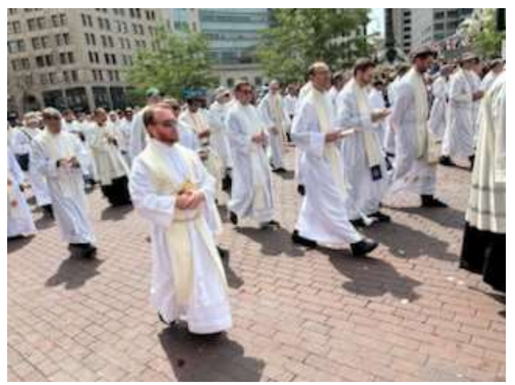
2022. The Congress, held July 17-21 at the Indiana Convention Center and adjacent sites, included a packed schedule of liturgies, talks, performances, and exhibits, all focused on the Eucharist as the source and summit of the Catholic faith.