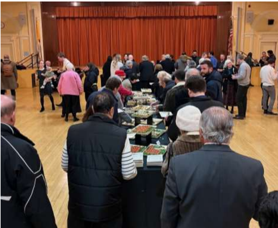
Reception in the school auditorium celebrates 125 glorious years!

May the Holy Spirit continue to ignite us, send us vocations both religious and lay, to join in the Eymardian family, and continue to burn brightly with a Eucharistic zeal that makes all of Jesus Christ in the Eucharist known to the world. May this year bear fruit now and for the next 125 years of service to the church of the United States of America. As Saint Peter Julian Eymard would say, “ May thy Eucharistic kingdom come. ”