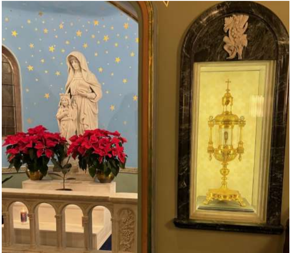
Saint Anne Shrine at the Saint Jean Baptiste Church with the relic of Good Saint Ann