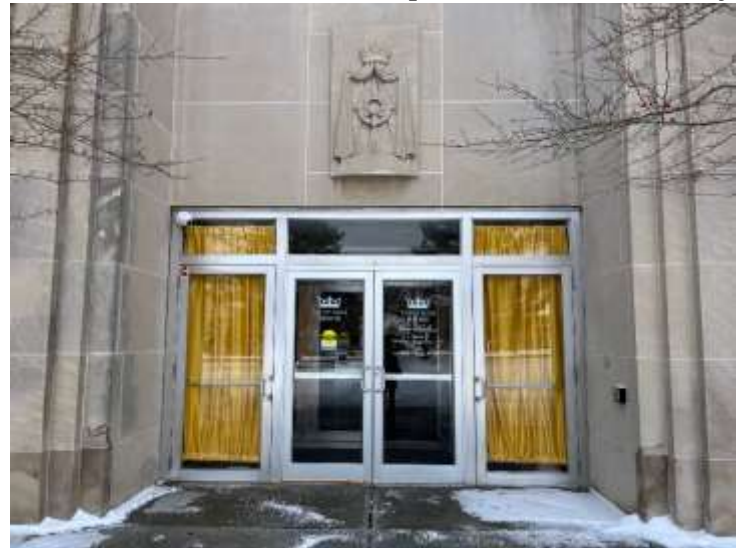
The entrance to the Oratory and Diocesan Shrine of Saint Ann from Wilson Mills Road.

church for this holy year. After Pope Francis opened the holy doors in Rome, as a sign that we open our own lives/hearts to Christ for renewed grace, each diocese also opened their holy doors and designated churches and shrines. For the church of Cleveland, 12 sites were chosen: nine parishes and three shrines. We participated in a special diocesan liturgy to open the Jubilee Year for the eight countries of the Diocese of Cleveland and had a special ritual, procession, and Mass to open this Jubilee Year of Hope. To unite the holy