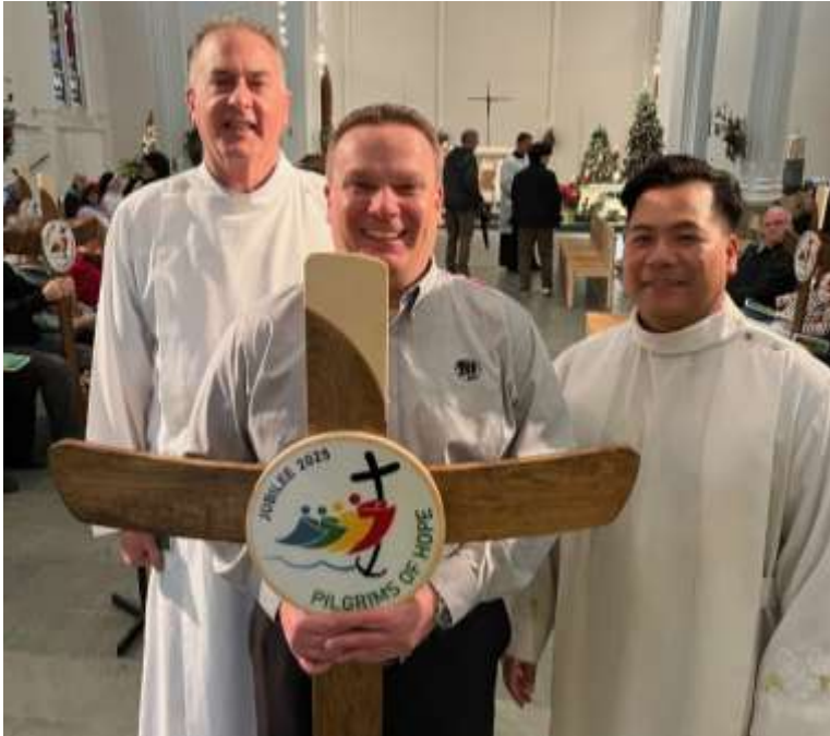
Receiving the Jubilee Cross at Saint Peter Church in Cleveland before the procession and blessing at the Cathedral

1. Everyone knows what it is to hope. In the heart of each person, hope dwells as the desire and expectation of