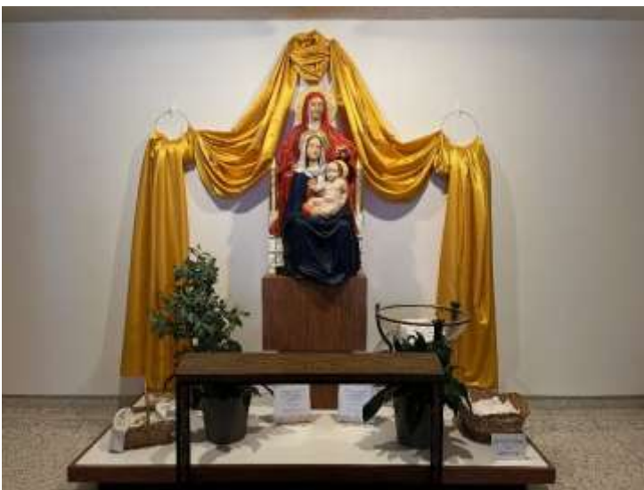
During the Jubilee Year the statue of Saint Ann will return to the Oratory