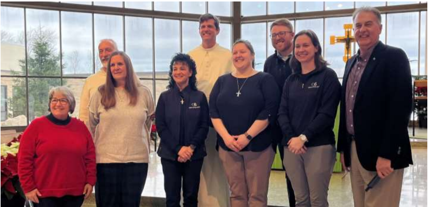
During the day school, another panel ( similar vocations and folks ) shared their stories ( with a different seminarian and single person ).