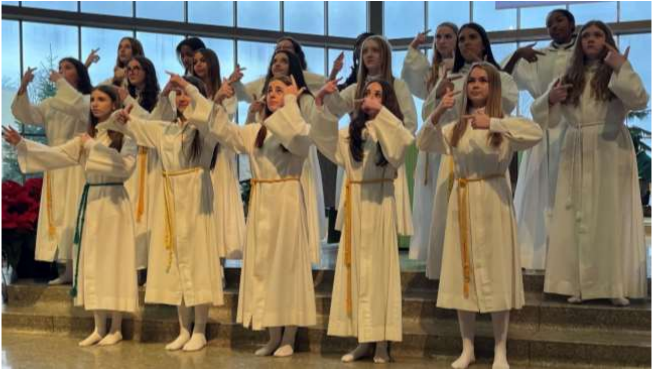
Our 8th graders keep the tradition of signing a special song of blessing and gratitude for their education and love of God.