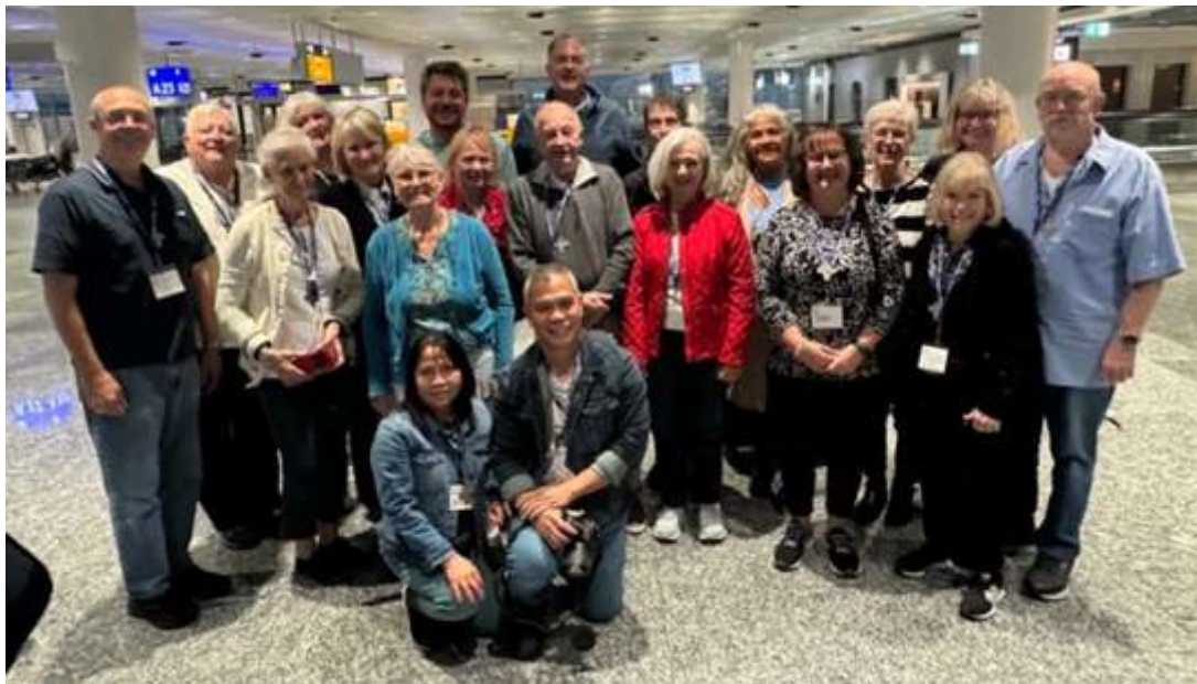
November 2024 Eymard Pilgrimage Group