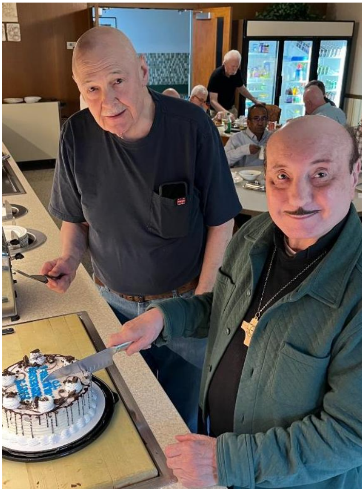
At our SSS dinig room, we enjoy an ice cream cake with the jubilarians

We thank these two men for their service to the Congregation and its various communities, our parishes, neighborhoods, and the Church in the USA. We appreciate and admire their witness and dedication to their religious profession of vows.