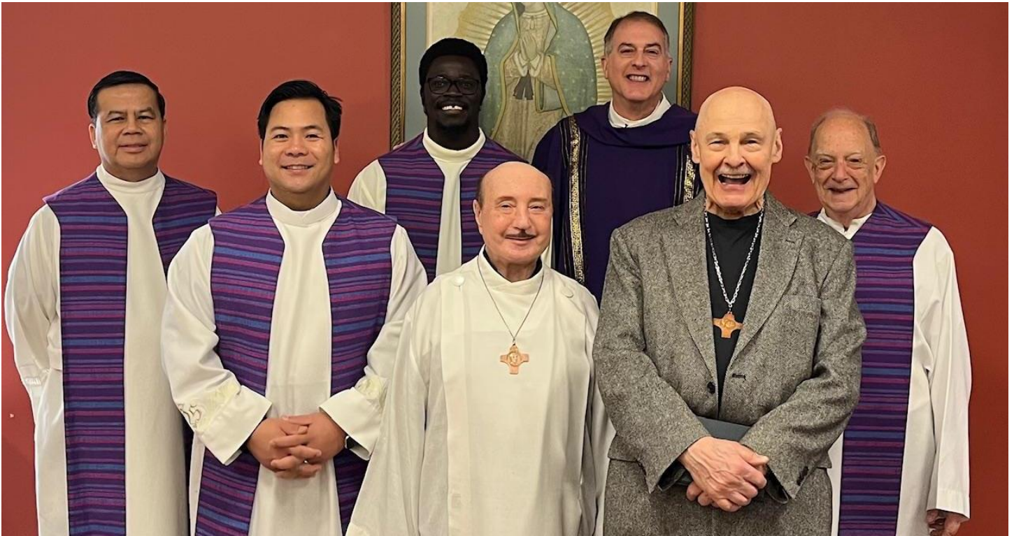
Concelebrants from the Mass gather for a candid photo opportunity before enjoying a reception provided by the lovely Ladies' Guild of Saint Pashal Baylon Parish

Mass and after Mass devotions, and within the parish by being part of the Art & Environment Committee, recitation of the rosary, and assistant sacristan duties. We are so happy he shares his care, gifts, and talents.