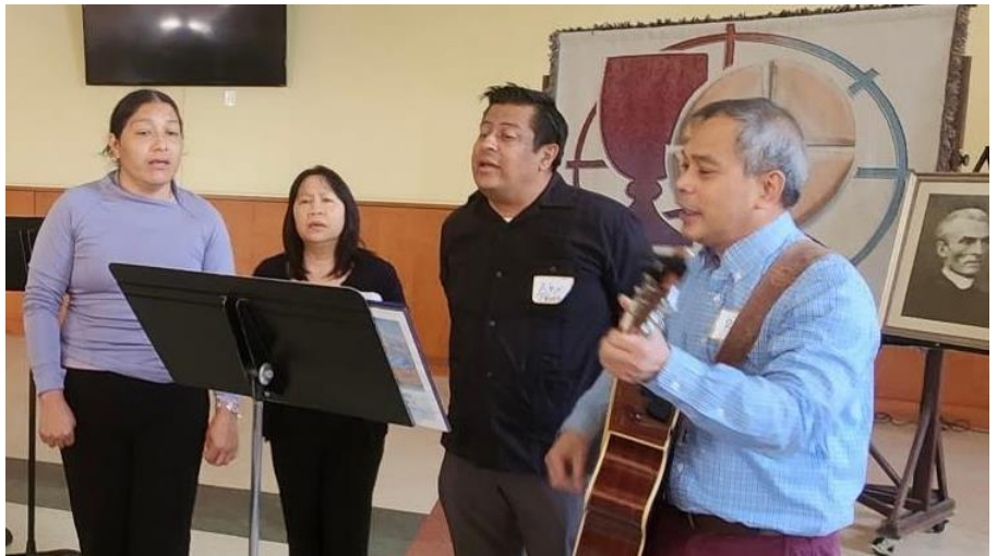
Mini-choir led us in song, even during lunch in the Prefontaine Hall. Notice the special 125 th -anniversary tapestry banner shared in all of our SSS parishes across the country.