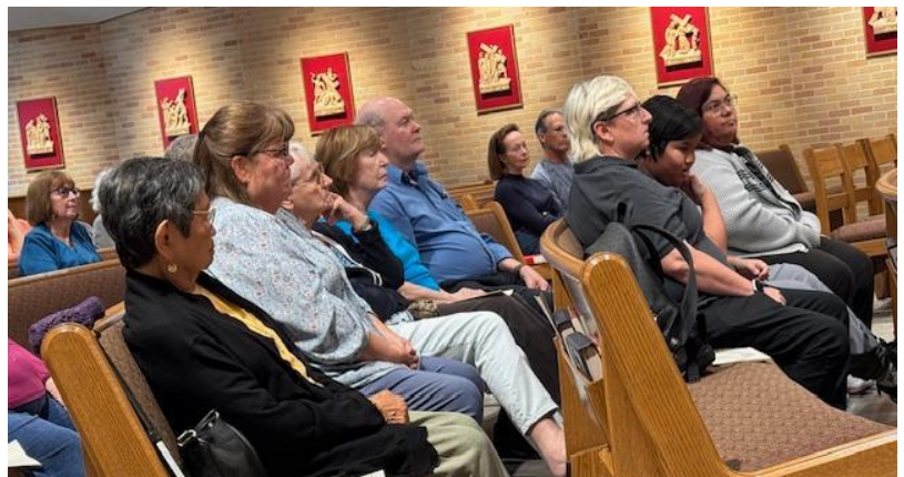
Participants listen attentively to the Mission presentations