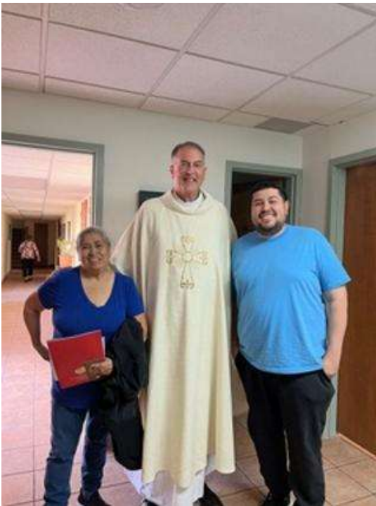
On the right, from altar server to dentist with his mom!