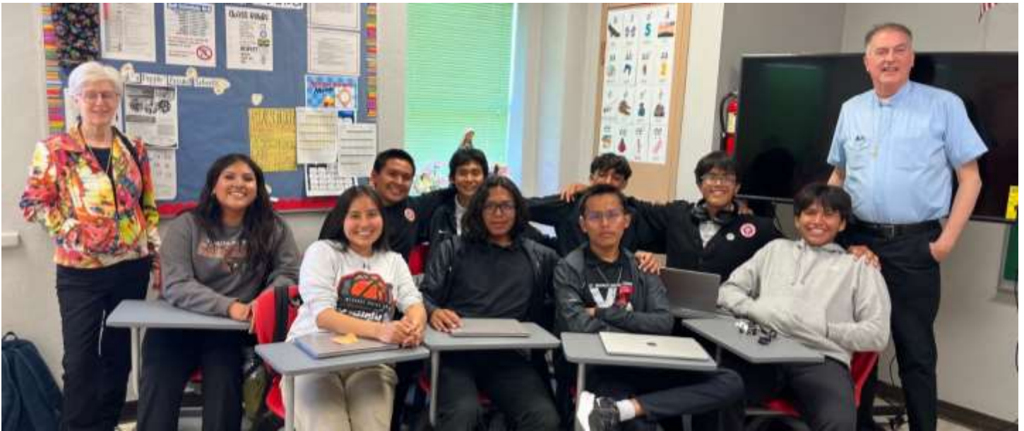
Meeting with the high school seniors to chat about vocations and their plans.