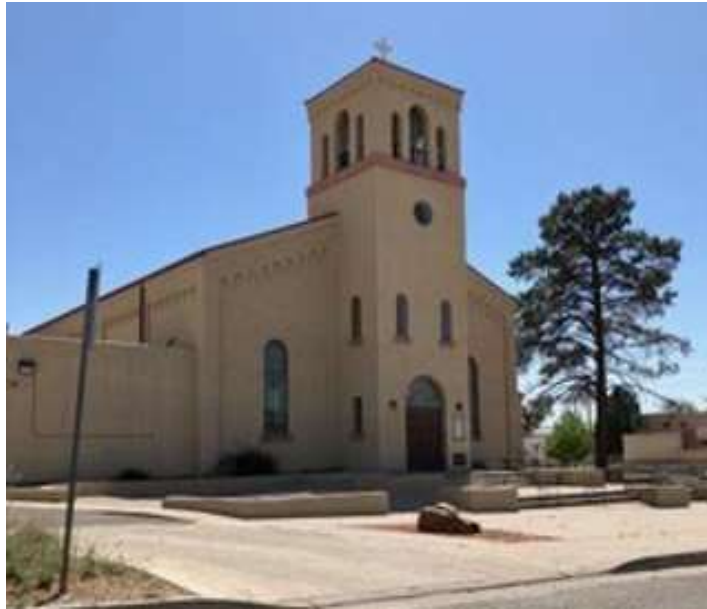
Saint Charles Borromeo Church in Albuquerque, New Mexico.