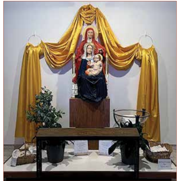
The statue of Saint Ann with special bunting. During the Jubilee Year, the statue of Saint Ann will return to the Oratory

As we fondly remember the 125 years the Blessed Sacrament Congregation has served the United States, please share your story of how your relationship with the Congregation of the Blessed Sacrament came to be by emailing me at sgongos@blessedsacrament.com or calling me at 440-449-2700. I'm so thankful when I receive your phone calls, as they always brighten my day!