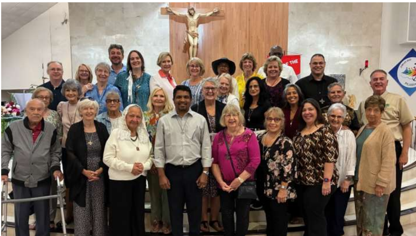
Some of the Diocese of Saint Petersburg associates with leadership based at Saint Vincent de Paul in Holiday, Florida, which encompasses 5 parishes in the diocese.