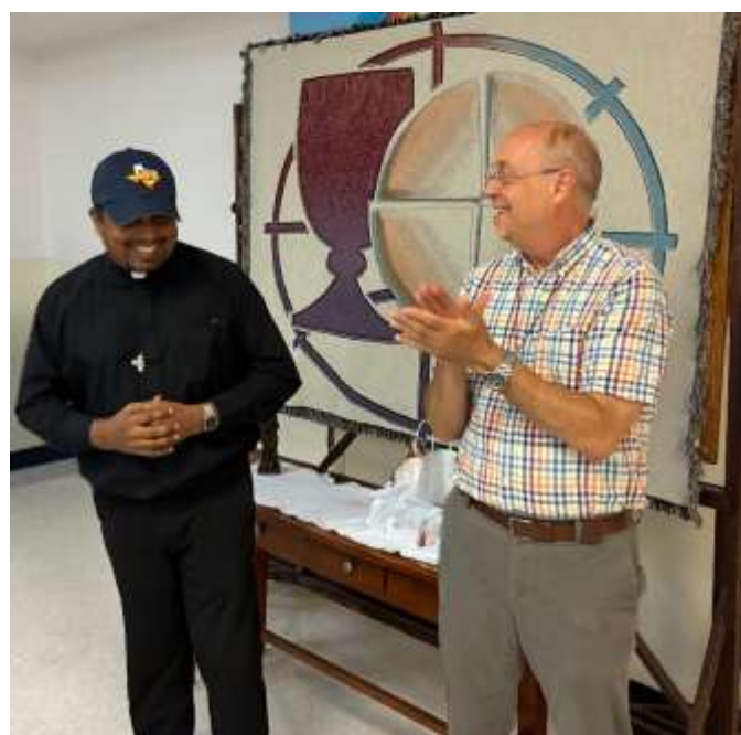
A Texas baseball cap is a big hit