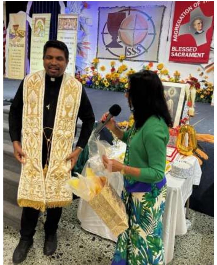
Each of the local leaders from the five parishes in the Diocese of Saint Petersburg, Florida