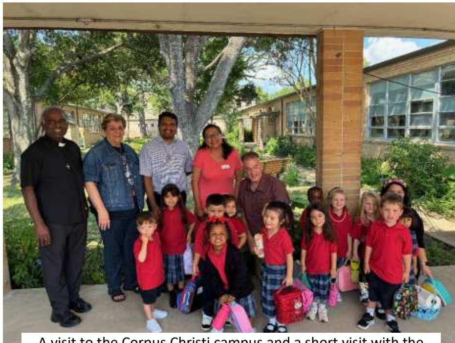
A visit to the Corpus Christi campus and a short visit with the preschool of our Catholic school