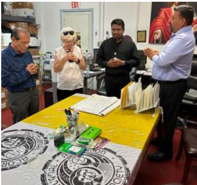
Blessing of the Nocturnal Adoration Society in the USA headquarters in Laredo, Texas