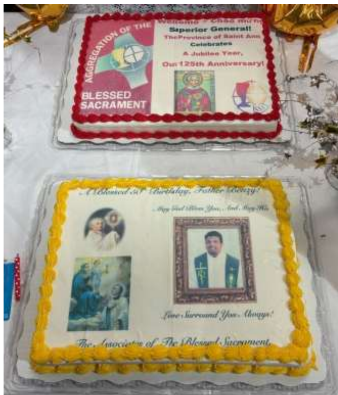
Birthday cake and a special gift to remember the 50 th birthday of Father General