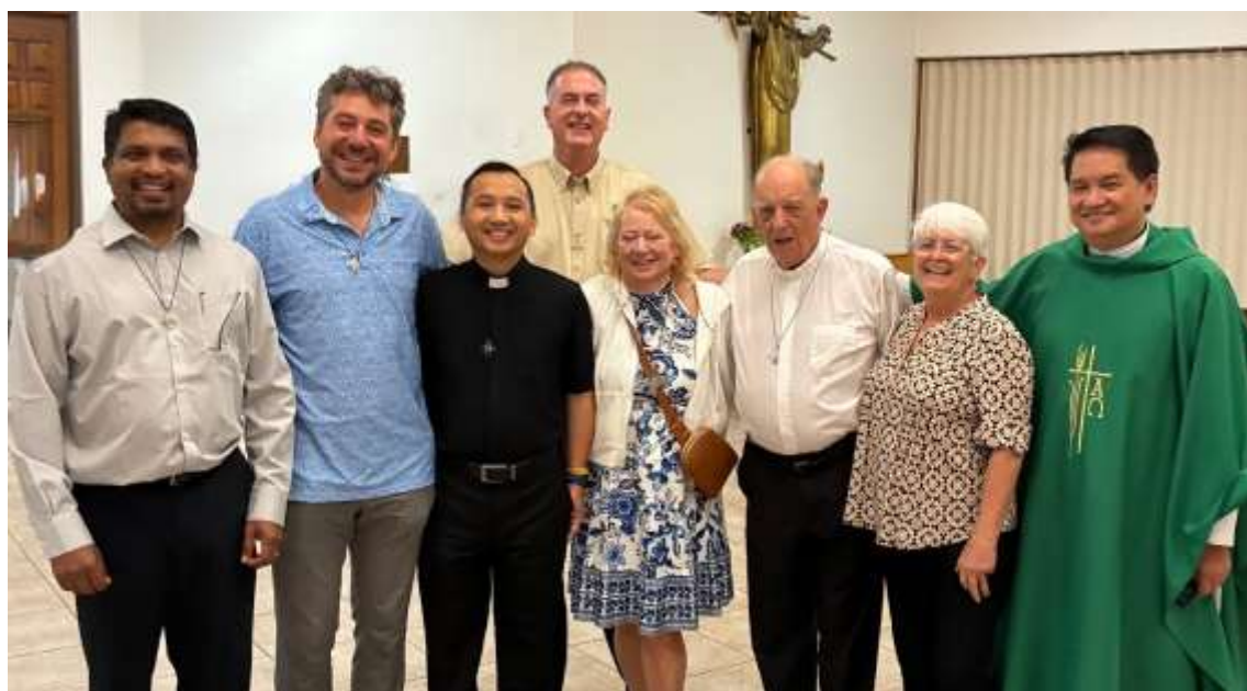
Some of the Diocese of Saint Petersburg associates with leadership based at Saint Vincent de Paul in Holiday, Florida, which encompasses 5 parishes in the diocese.