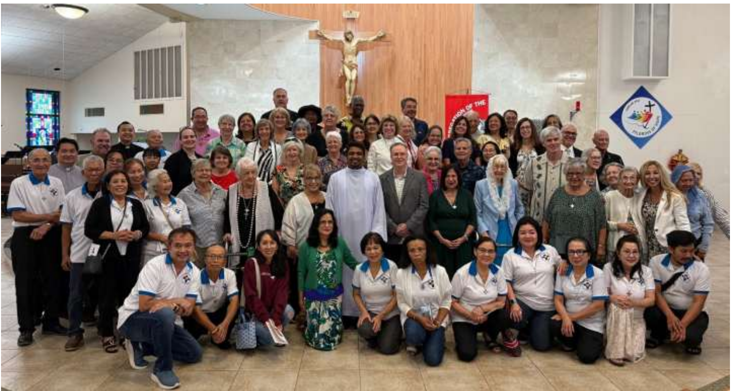
Some 100 of the Associates from the Diocese of Saint Petersburg for the special visit and prayer with Father General and the five new associates who were received into the Eymardian Family