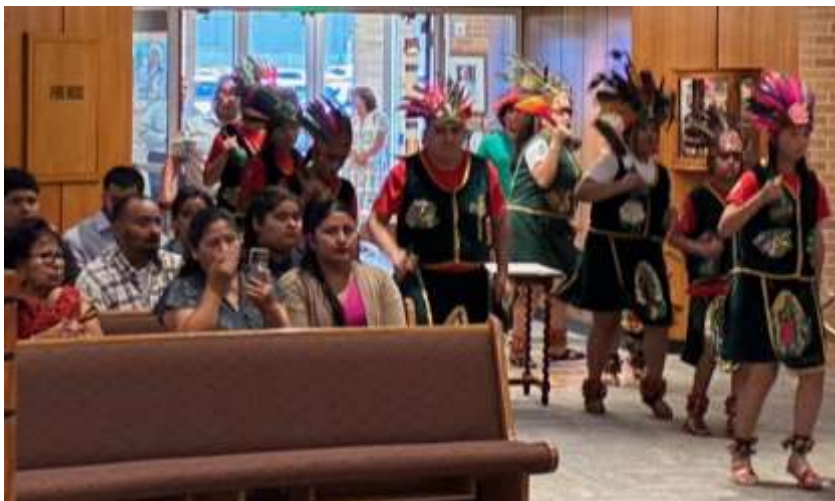
Matachinas tradition continues with praise and worship of God and lead us to the parish hall for a cultural festival