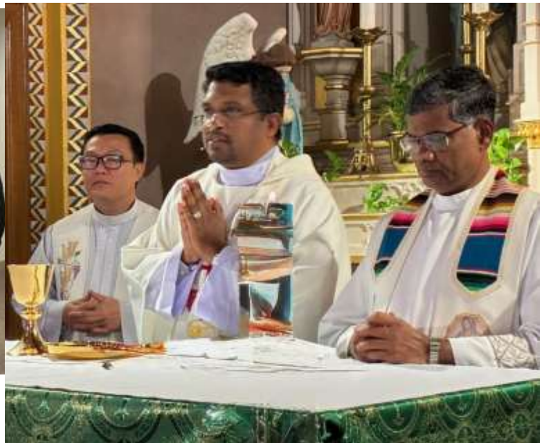
Parish staff of Downtown Saint Joseph Parish at a concelebrated Mass