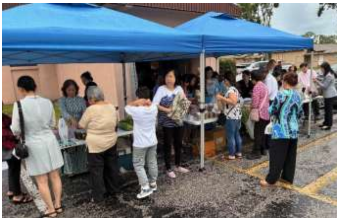
Farm Market run by the Vietnamese community of Saint Vincent de Paul between the Masses