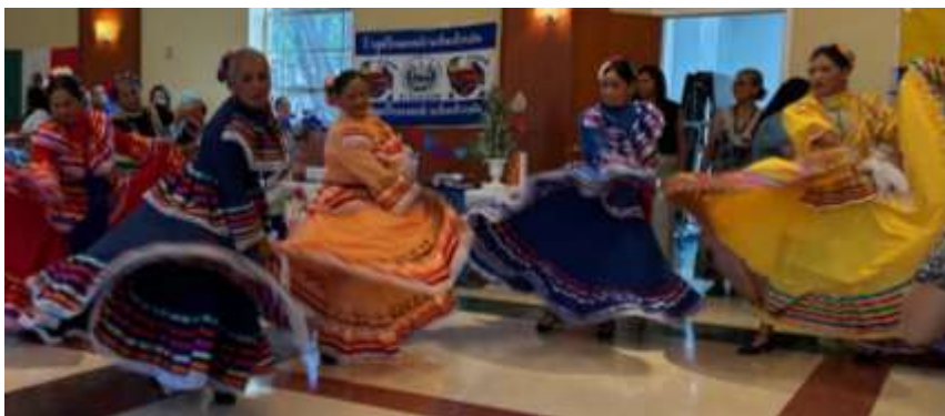
Many cultural groups share their native dances and culture